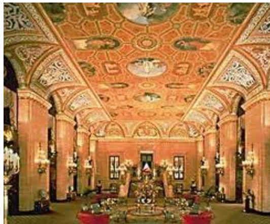
Palmer House, Chicago Hilton Site for the 2015 Annual Meeting of the American Sociological Association,

The purpose of the Mathematical Sociology Section of the American Sociological Association is to encourage, enhance and foster research, teaching and other professional activities in mathematical sociology, for the development of sociology and the benefit of society, through organized meetings, conferences, newsletters, publications, awards and other means deemed appropriate by the Section Council. The Section seeks to promote communication, collaboration and consul-