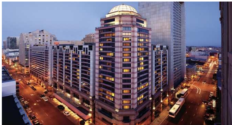
Site for the 2014 Annual Meeting of the American Sociological Association,

The purpose of the Mathematical Sociology Section of the American Sociological Association is to encourage, enhance and foster research, teaching and other professional activities in mathematical sociology, for the development of sociology and the benefit of society, through organized meetings, conferences, newsletters, publications, awards and other means deemed appropriate by the Section Council. The Section seeks to promote communi-