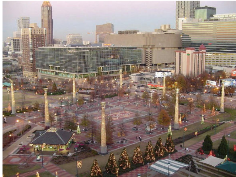
Centennial Park, Atlanta GA