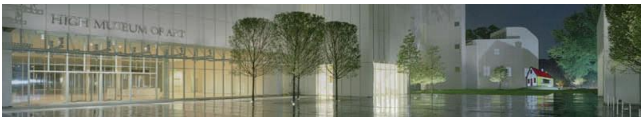
High Museum of Art, Atlanta GA