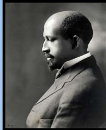
W.E.B. Du Bois

This award honors scholars who have shown outstanding commitment to the profession of sociology and whose cumulative work has contributed in important ways to the advancement of the discipline. The body of lifetime work may include theoretical and/or methodological contributions. The award selection committee is particularly interested in work that substantially reorients the field in general or in a particular subfield. Nominations should include a copy of the nominee's curriculum vitae and letters in support of the nomination. The most compelling cases contain five to eight letters from a variety of individuals able to speak to the qualifications of the nominees. The person making the nomination