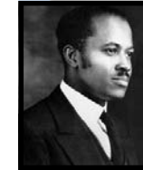
E. Franklin Frazier

of these outstanding African-American scholars and educators. Nominations should include a one to two page statement and a vita, if applicable.