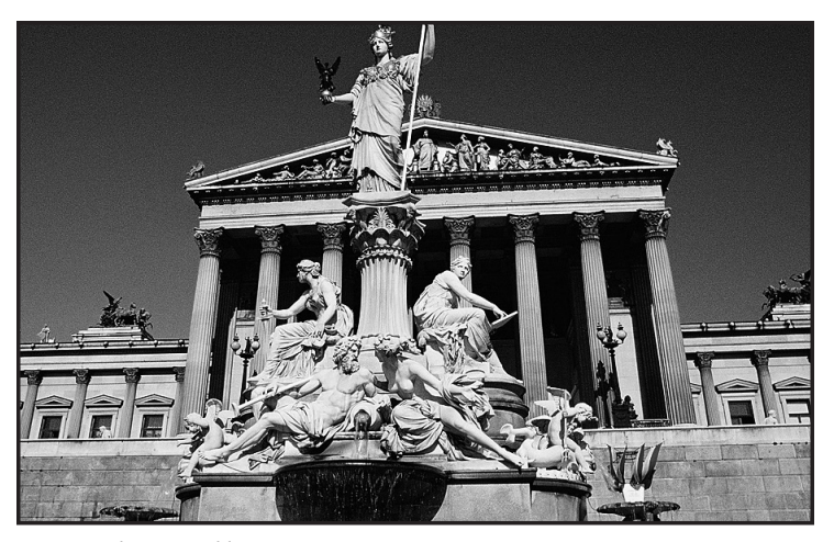
Austrian Parliament Building

One topic of great interest for Austrian sociology is social inequality, especially structural analyses of inequality in work situations and regarding poverty and migration. With the current