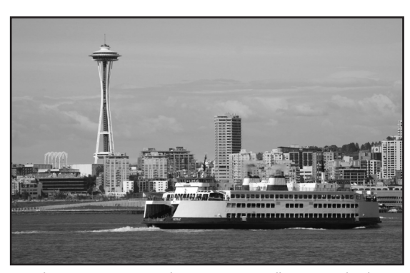
A Washington State Ferry makes its way across Elliott Bay under the watchful eye of the Space Needle.

Amazon, Costco, Zillow, Nordstrom, and Starbucks. Seattle has its corporate giants, but it also has its local small start-up entrepreneurial, even frontier, spirit. In late August you will find Seattle and surrounds to be quite pleasing, with