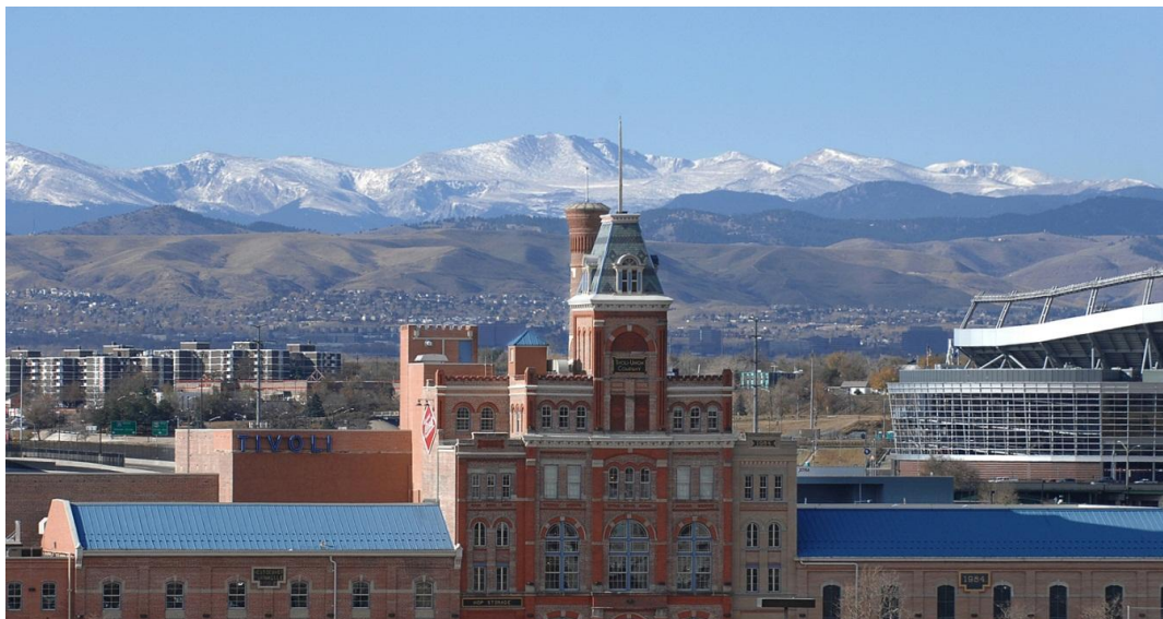
Pictured: Tivoli, Auraria Campus, University of Colorado-Denver 900 Auraria Parkway, Denver, CO 80217