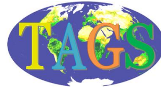
Caucus-Transnational Approaches to Gender and Sexuality