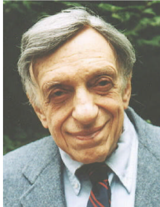
Milton M. Gordon

M ilton Gordon's 1964 book, Assimilation in American Life , reflected upon a half century's assimilation and acculturation of European whites and their children just as professional interest in the topic was waning because immigration had ended long ago. When in the 1980s sociological attention returned to these issues, as a result of interest in the second generation of Asians and Latin Americans, social scientists returned to Gordon's distinctions between assimilation and acculturation, and, above all, his concept of structural assimilation. First of all, Gordon's concepts provided a very good fit to the evidence then as they do now. Faintly acculturated Latino immigrants understand the importance of the Oakland Raiders, as Cheech and Chong pointed out in "Born in East LA." This cultural knowledge gives access to American society, but it does not strip immigrants of their independent primary group structures. Just as Gordon explained, ethno-religious and ethno-national minorities commonly retain