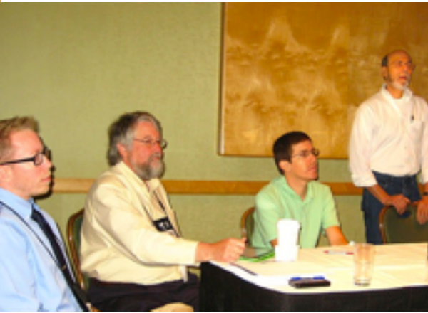
The 2013 ASA Annual Meeting in New York City