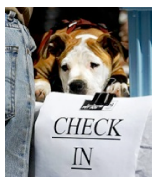
VET SOS check in: Waiting to be seen at the Project Homeless Connect clinic in San Francisco.

contact on my own. I also got to accompany a veterinarian and her team on "house calls" into homeless camps, where I would not have ever ventured alone. This is another example of the approach I mentioned, where I asked for help gaining access for the research but also asked what the organizations were interested to learn about the populations to which they provided services. I was able to provide them with information on the backgrounds of their clients, which gets omitted from veterinary histories, and I also created a directory of veterinary services for the homeless, which is available to the transient population.